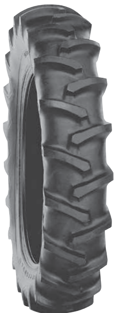
FIELD & ROAD - R-1