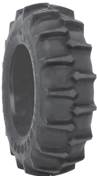
CHAMPION HYDRO ND - R-1