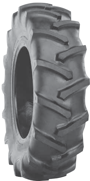
IRRIGATION SPECIAL - R-1