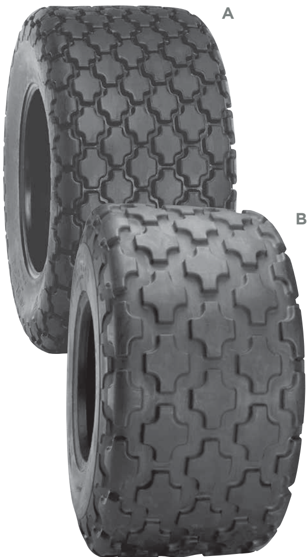
ALL NON-SKID TRACTOR - R-3