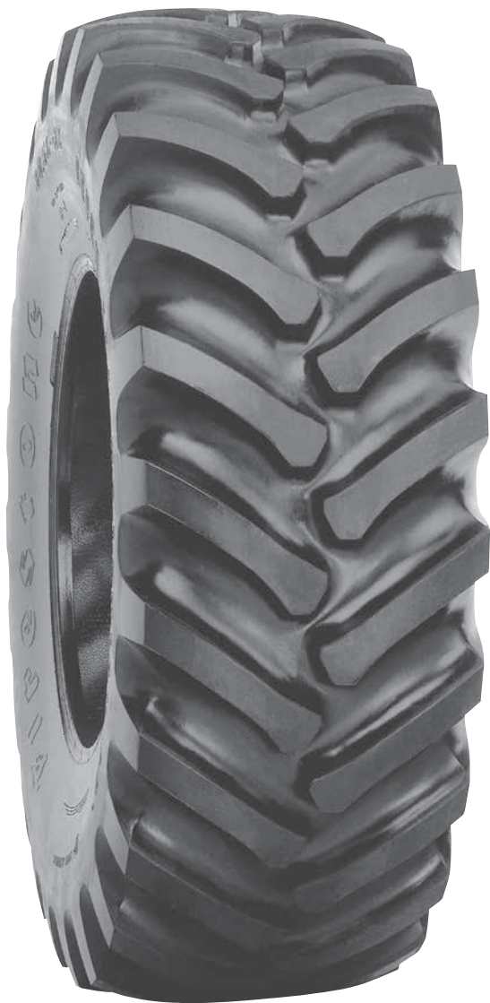
SUPER ALL TRACTION II 23° - R-1