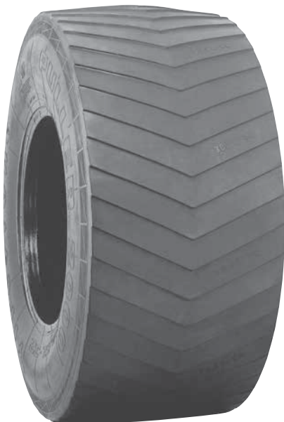
PULLER 2000 - HP